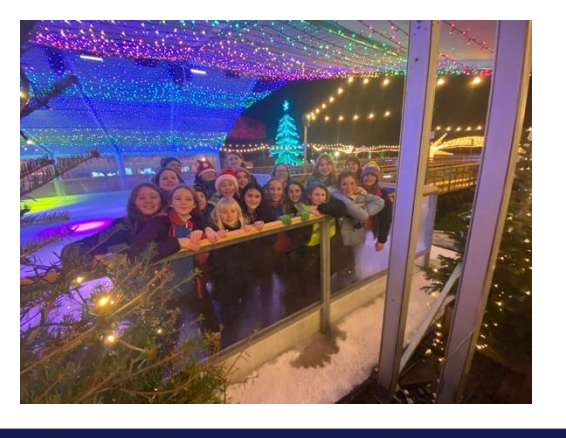
Ice skating and Christmas Angel festival