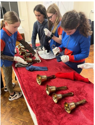
Bell ringing practice for Christmas