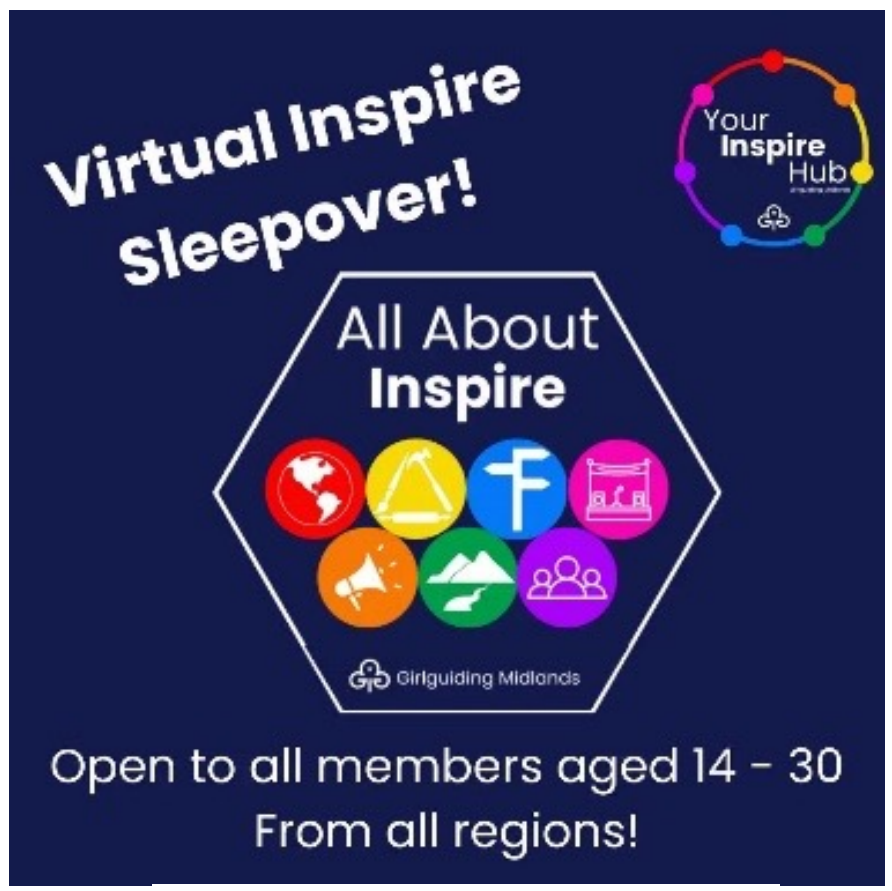
31st May - 2nd June on Zoom

Open to all members aged 14-30 from all regions! Midlands has launched our Inspire challenge badge online through a series of Zoom sessions across the weekend on a virtual sleepover, exploring each of the 7 Inspire pathways. There will also be some whole weekend challenges and chances to earn one or two of our new badges! Open to all Girlguiding members aged 14-30 for the chance to connect with members from across the region or country.